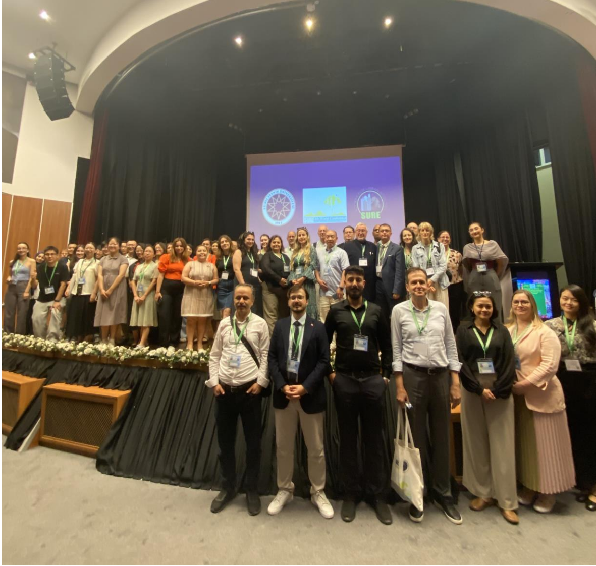
Photo 2: Participants of the SURE General Assembly