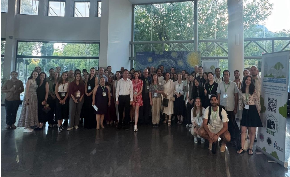
Photo 1: From the Opening Reception of the 4th SURE World Conference

On the evening of the first day, the opening reception was held with a large turnout. Scientists from various countries gathered in a friendly and dynamic setting where they exchanged ideas not only socially but also scientifically. The event provided a valuable opportunity for networking, and many participants engaged in discussions about potential future collaborations, brainstorming project ideas shaped by interdisciplinary approaches (Photo 1).