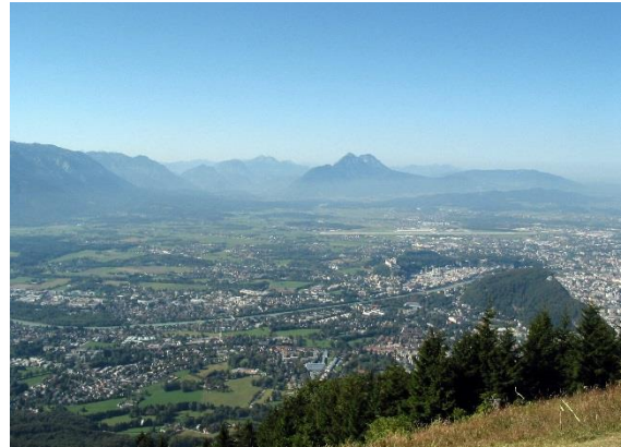
View from the Gaisberg Mountain in Salzburg

To establish the cooperation with Tabriz University (Iran) further, a symposium will be held 29-30 April 2019, Tabriz, University. The symposium Urban Green and climate change will focus on the evaluation of urban green infrastructure and green spaces in arid, humid and changing conditions and will take into account in particular metropolitan areas. The symposium will be organized by SURE Iran and include partners from Tabriz University, Tabriz Municipality, Tabriz city council and Eynali Development Organization and Natural Park.